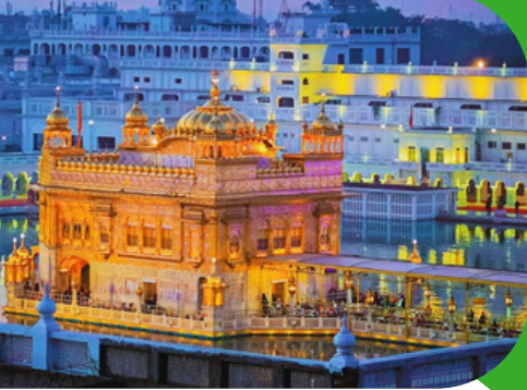
Golden Temple (Harmandir Sahib)