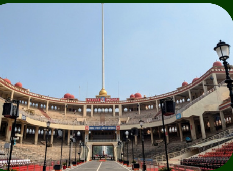
Attari - Wagah Border